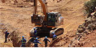
Our Excavator hard at work on the Bergbron Water Pipe Line Installation.

However, on the infrastructure development side we have seen an encouraging demand, with various larger scale projects taking place in our immediate area. Renico Plant Hire supplied three excavators to ESOR for use on the new Bergbron water line being installed by Rand Water. Rand Water has been installing large steel water pipes from Bergbron all the way past Honeydew to Cosmo City. We believe these will form part of a larger project where new and larger water pipes are brought all the way from the Vaal River.