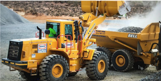
One of the new Kawasaki Front End Loaders operating in the Northern Cape.

Renico Plant Hire also changed brand and along with the excavators bought 2 Kawasaki 80Z5 Front End Loaders from ELB Equipment, which were then transported to work alongside the Cone Crusher on this Northern Cape job.