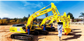
New Sumitomo 30 ton Excavators – one with a Furakawa hammer attachment.

Renico Plant Hire has taken delivery of 6 new Sumitomo excavators from ELB Equipment. Two of the new 30 ton Excavators are fitted with a quick detach coupling and 30 ton Furukawa FXJ375 Hammers. A new FXJ275 Furukawa hammer was also bought to replace a worn out hammer on one of our 21 ton Sumitomo Excavators. In total three 30 ton Sumitomo and three 21 ton Sumitomo excavators have been purchased.